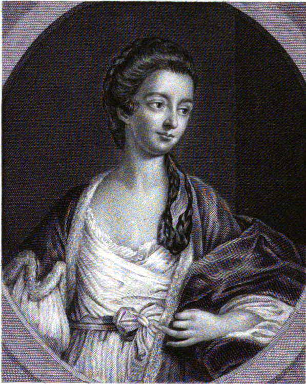
Sir J. Reynolds, pinx t